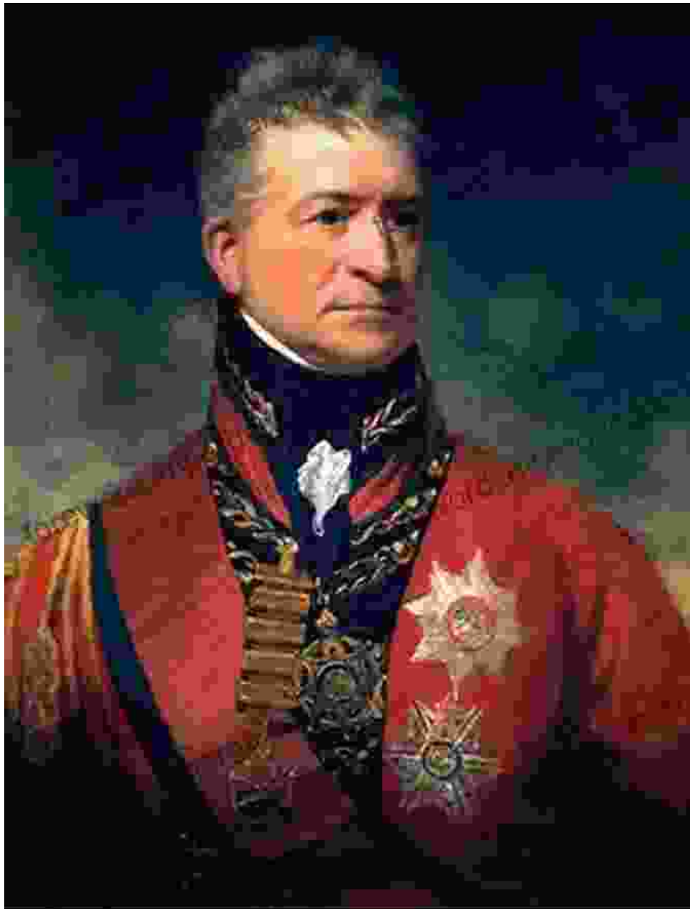
General Lowry Cole

Thomas Picton, a Welshman born in Haverfordwest, was known for his fiery temper and aggressive leadership style. A veteran of the Napoleonic Wars, Picton brought a wealth of experience to the Peninsular campaign. He played a decisive role in the Battle of Quatre Bras (1815), where his troops held off repeated French attacks, allowing Wellington's forces to regroup and prepare for the Battle of Waterloo.