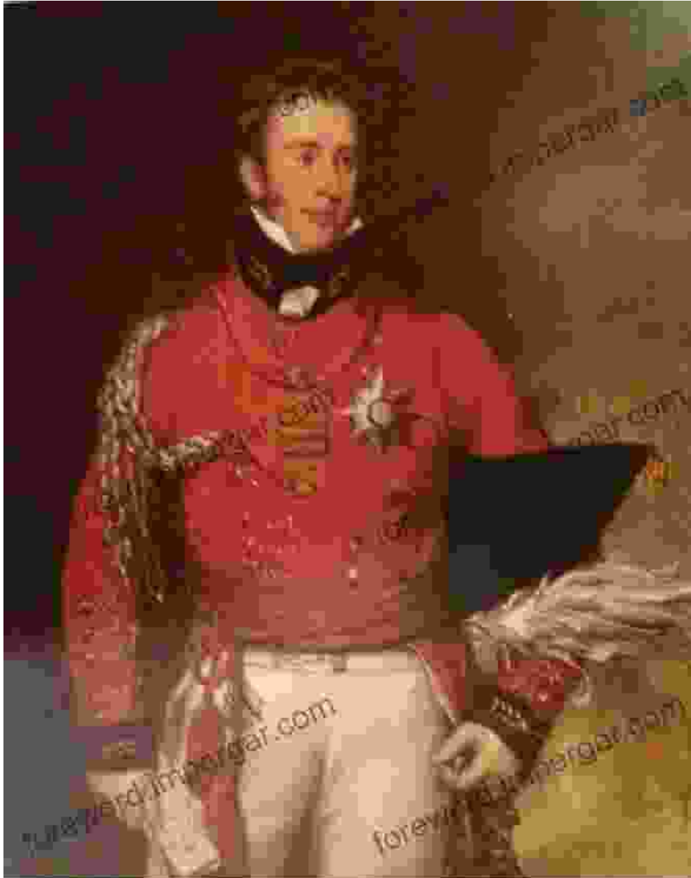
General Edward Pakenham

role in the Battle of Salamanca (1812), where he led a charge that broke the French center. However, tragedy struck at the Battle of New Orleans (1815), where Pakenham was mortally wounded while leading an assault on the American forces.