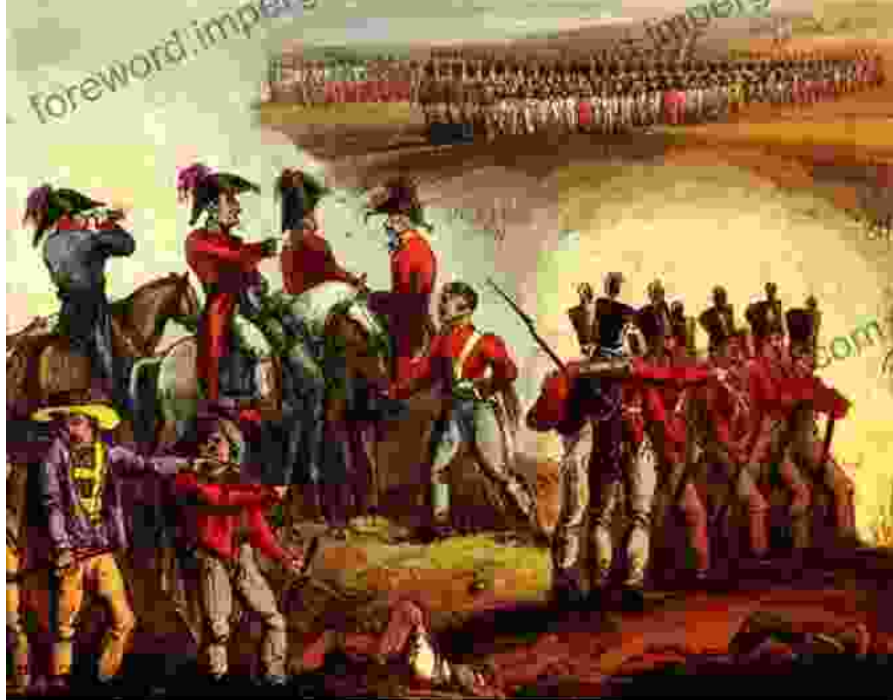
The Peninsular War