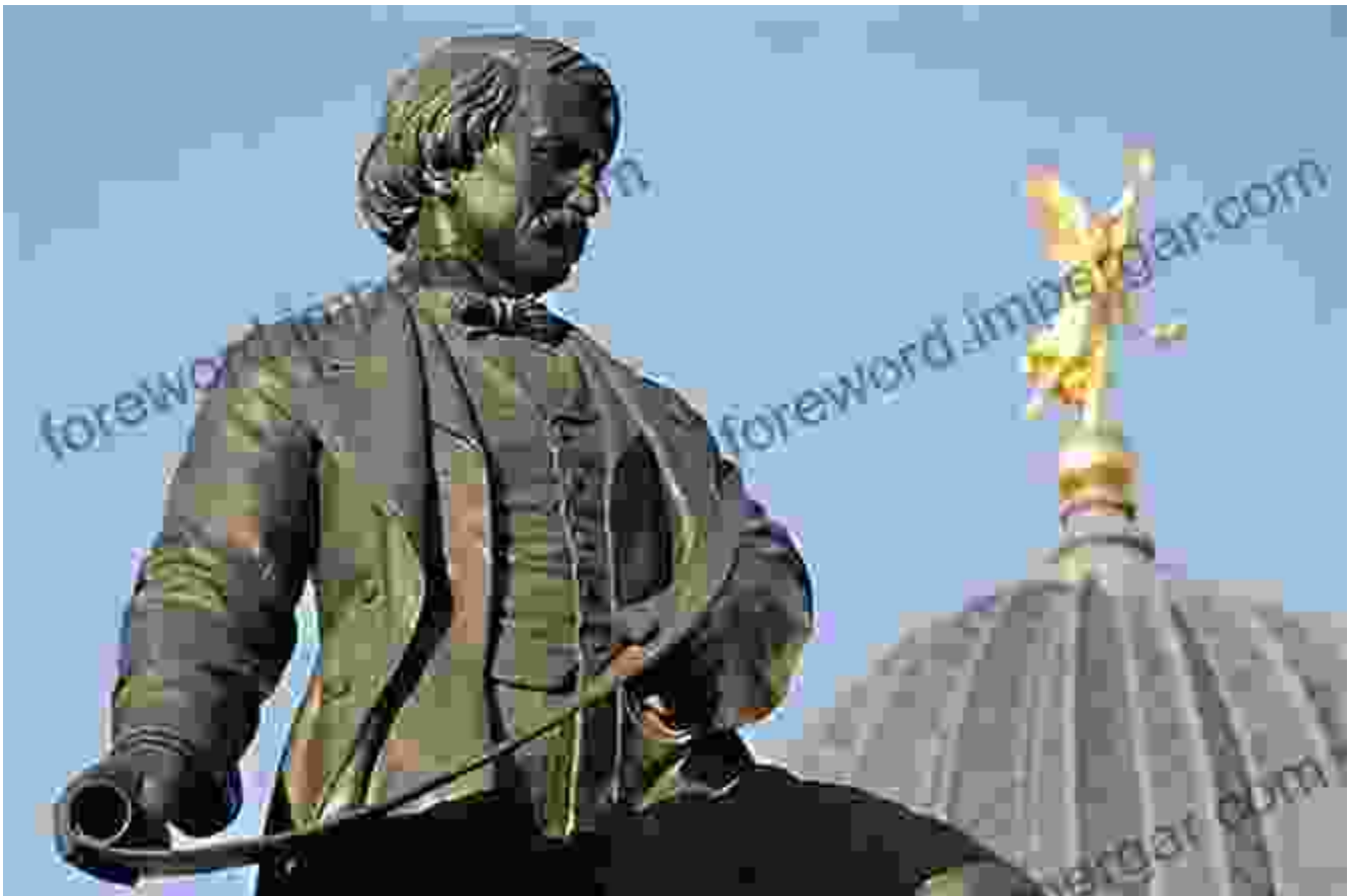
Statue of Gottfried Semper by Adolf von Donndorf (1892)