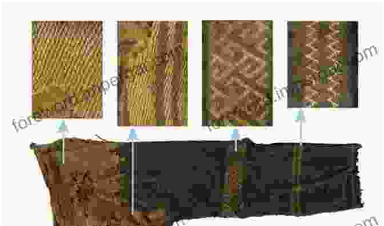
Intricately woven Tarim Basin textile with Chinese and Central Asian motifs

Linguistic evidence further supports the theory of cultural exchange. Analysis of mummies' DNA and the discovery of ancient manuscripts have revealed the presence of Indo-European languages in the Tarim Basin, suggesting connections with Western migrations.