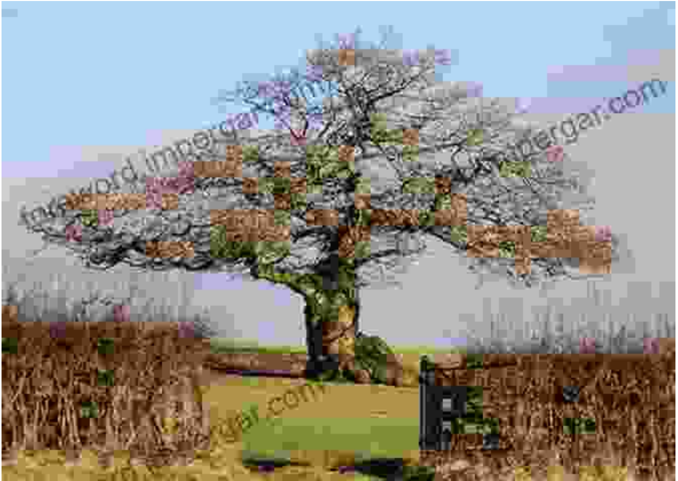
Caption: The tree of liberty, a potent symbol of national pride and unity