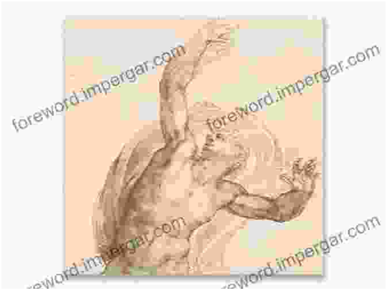
Fig. 2: Michelangelo, The Risen Christ, c. 1532

Michelangelo's drawings also reveal his profound understanding of human anatomy and movement. His figures are imbued with a sense of dynamism and grace, showcasing his exceptional ability to convey the human form with accuracy and emotion.