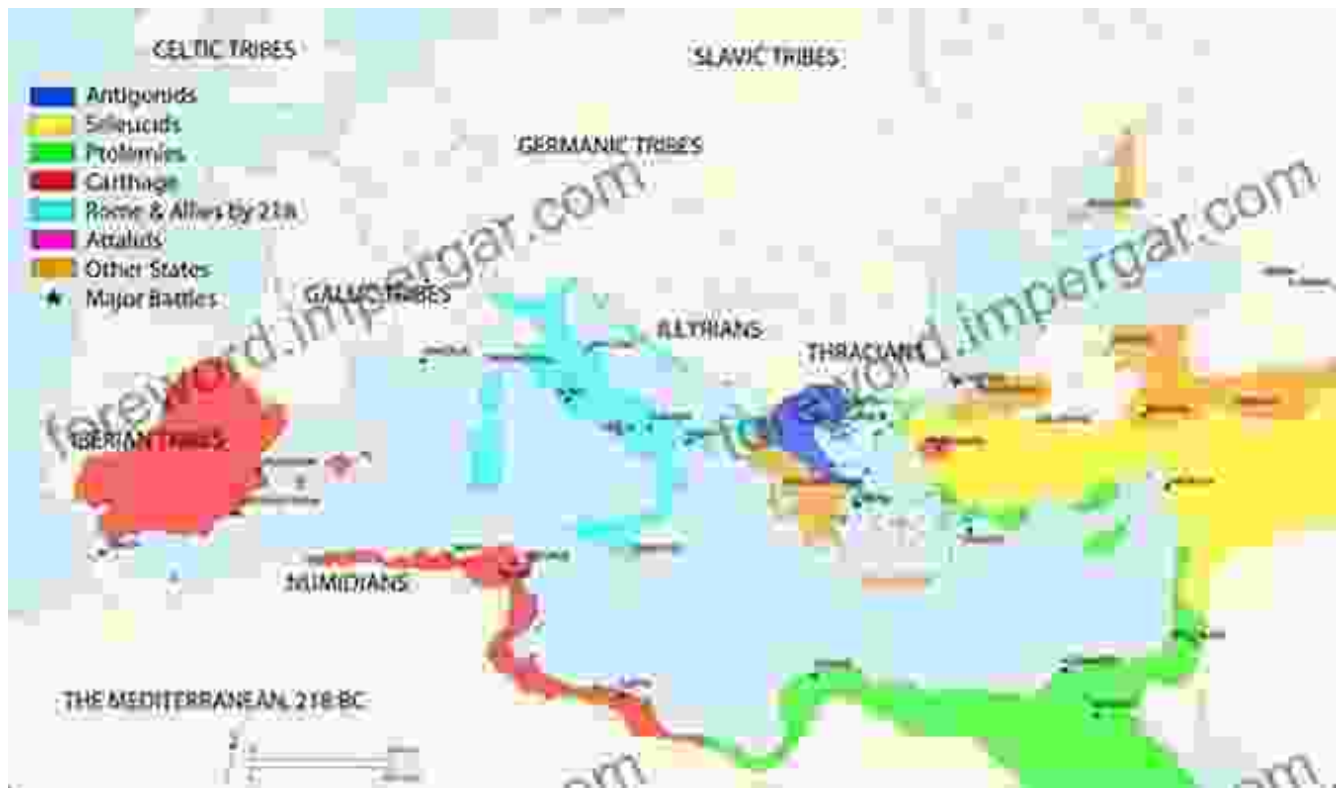
Image Alt Text: A historical map of the Mediterranean Sea, showing the locations of Cattaro and Elba.