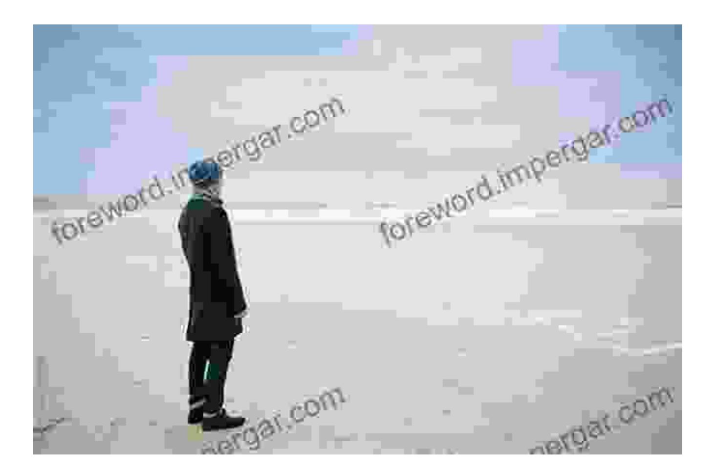
Castaways - Adrift and Abandoned: Thrilling Tales of the Sea (vol.3) by Graham Faiella

Imagine yourself stranded on a desolate island, alone and forgotten. Cut off from civilization, your only companions are the relentless waves and the unforgiving wilderness. Such is the fate that befell countless individuals throughout history, leaving behind haunting tales of survival, resilience, and heartbreak. In "Castaways Adrift and Abandoned," we embark on a journey to uncover these chilling narratives, exploring the depths of human endurance and the fragility of hope.